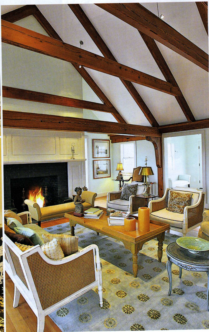
RAND LARSON/MORNINSTAR PRODUCTIONS