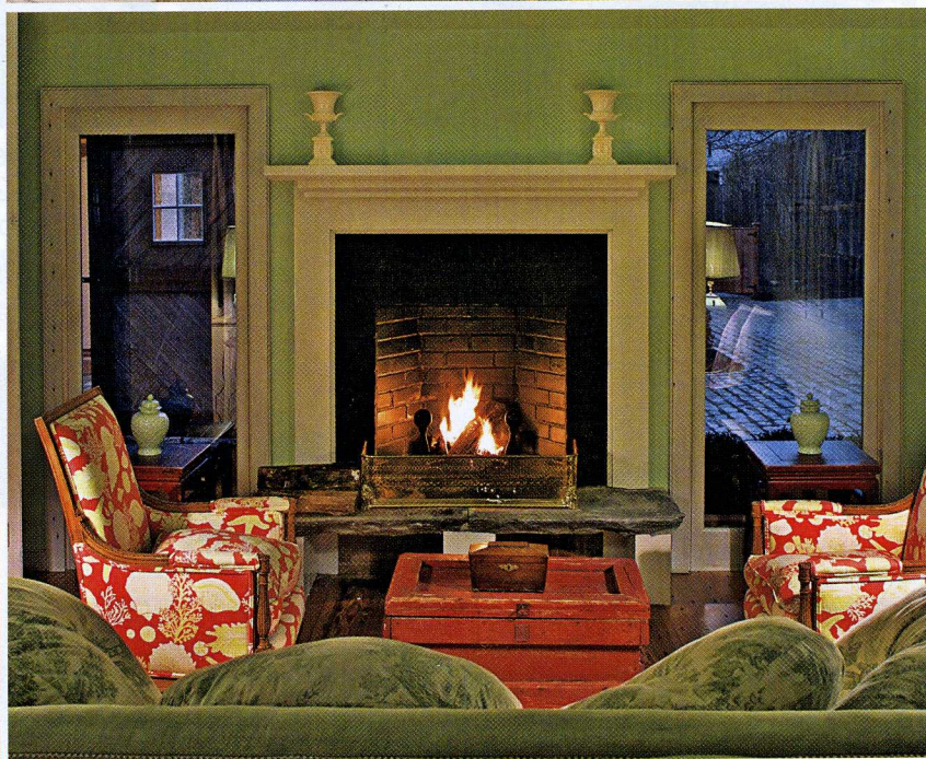
RAND LARSON/MORNINGSTAR PRODUCTIONS